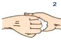
Backs of fingers to opposing palms with fingers interlocked