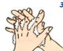
Palm to palm, fingers interlaced