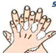
Right palm over back of left hand and left palm over back of right hand