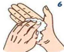
Rotational rubbing, backwards and forwards, with clasped fingers of right hand in left palm and vice versa