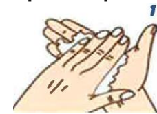
Palm to palm