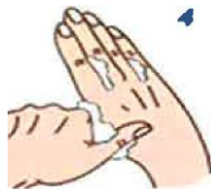
Rotational rubbing of right thumb clasped in left palm and vice versa